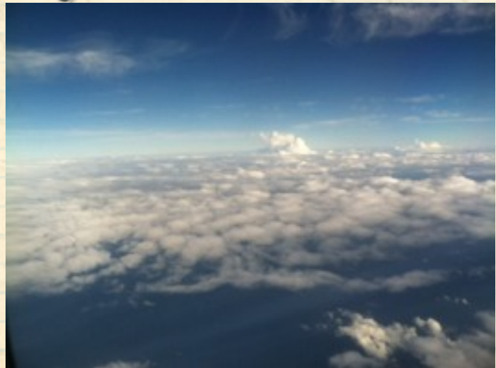
Flying over Gulf of Mexico to Cancun, Mexico