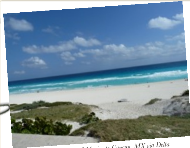
Flying over Gulf of Mexico to Cancun, MX via Delta